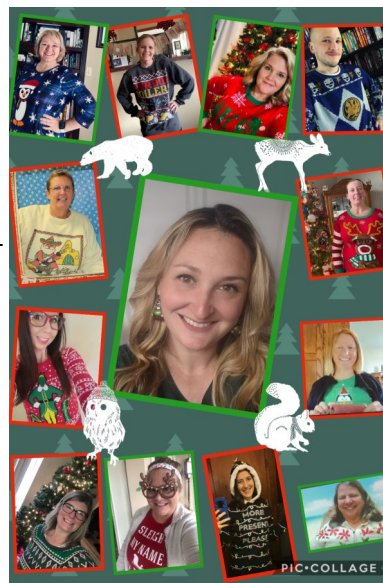
BT Staff get into the holiday spirit by wearing festive gear to class every Tuesday in December.

Believe it or not the semester is coming to an end and the holidays are right around the corner. For Thanksgiving our staff shared with each other what we are grateful for as a reminder of what we still have amongst all that has been lost. One of the many things for which I am grateful is the remarkable perseverance our staff and students have displayed this fall. Our staff has worked so hard to make online